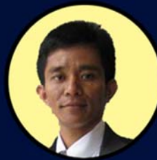
Watcharin Boonyarit Ministry of Energy